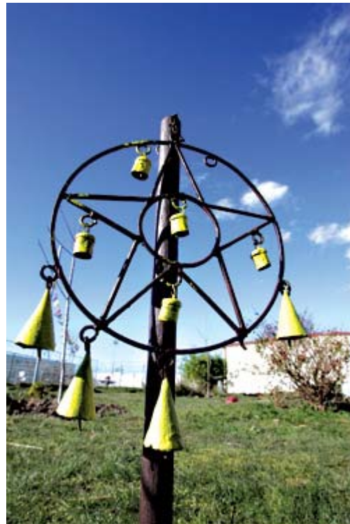
The sacred grounds at the Monroe prison.