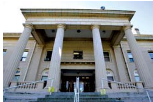
The Washington State Reformatory at Monroe.